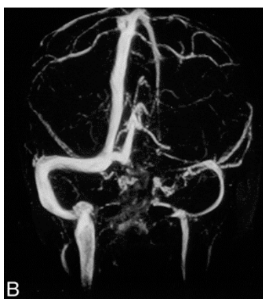
Figure 2: Flow void is seen in left transverse sinus. The superior sagittal and straight sinuses drain into the right transverse sinus