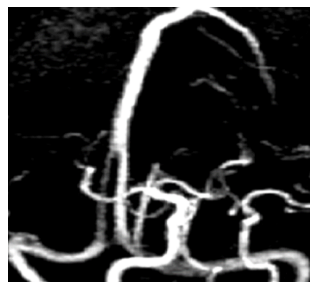
Figure 4: MR venogram showing splitting of Superior Sagittal Sinus in the posterior aspect