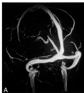
Figure 1: Right and left transverse sinuses are co-dominant. Both the superior sagittal and straight sinuses drain into the torcular herophili