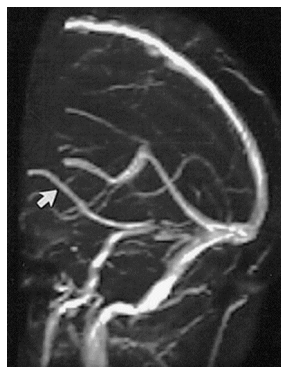
Figure 5: Arrow showing the Right Vein of Labbe