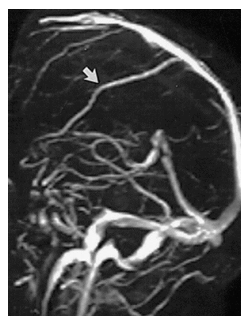
Figure 6: Arrow showing Right Vein of Trolard